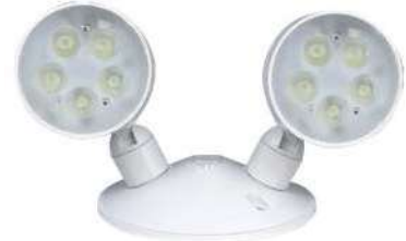
TL-EM002 (10W/ 14W)