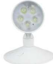
TL-EM003 (5W/ 7W)