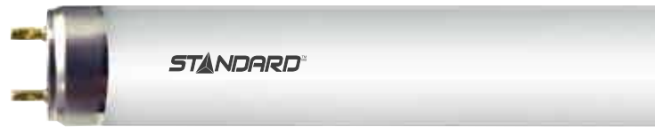
Nominal length : 18 in. (457 mm) Dia. : 1 in. (26 mm)

Order code: 62023 Description: F15T8/DL/PH/G13/STD UPC: 69549620230 Case quantity: 25