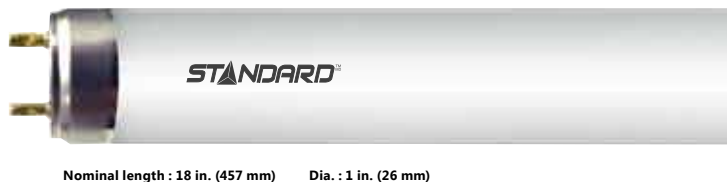
Nominal length : 18 in. (457 mm) Dia. : 1 in. (26 mm)

Order code: 62021 Description: F15T8/WW/PH/G13/STD UPC: 69549620216 Case quantity: 25