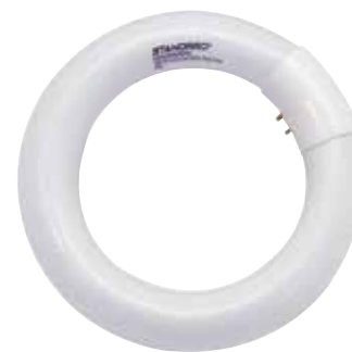
Nominal diameter : 7 in. (165 mm) Dia. : 1 3/16 in. (30 mm)

Order code: 58984 Description: FC6T9/CW/RS/4P/STD UPC: 69549589841 Case quantity: 12