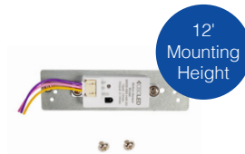
12V Motion Sensor* MS02-MW-HW-DC

Accessories to meet your projects every need (sold separately)