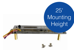
12V Motion Sensor* MS03-MW-HW-DC