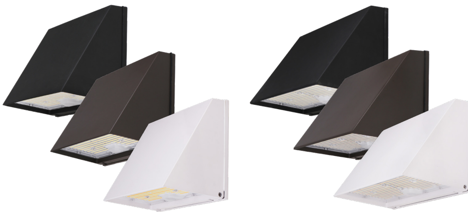
Pictured: 40W Models

Our Keystone Wall Packs set a new standard for outdoor lighting, combining style, functionality, and ease of installation into one exceptional product!