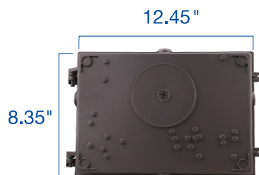
120W Classic Wall Pack

Retrofit-friendly for most other manufacturer classic style wall packs