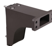
Fixed Mount FL-FM01-BZ

*Photocell Receptacle is REQUIRED for use with Photocell