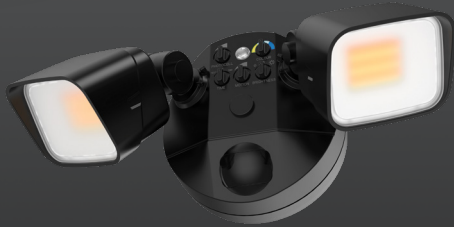
SS02 25W Security Light SS02-25W-2P-5CCT-BK