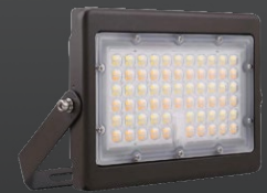
FLM02 80W Mini Flood Light FLM02-80W-3P-3CCT-UD