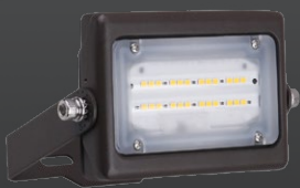
FLM02 15W Mini Flood Light FLM02-15W-40K-LV-YK