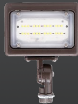
FLM02 15W Mini Flood Light FLM02-15W-40K-LV-KN