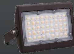
FLM02 50W Mini Flood Light FLM02-50W-3P-3CCT-UD